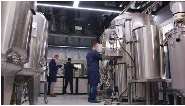
SuperMeat's pilot plant