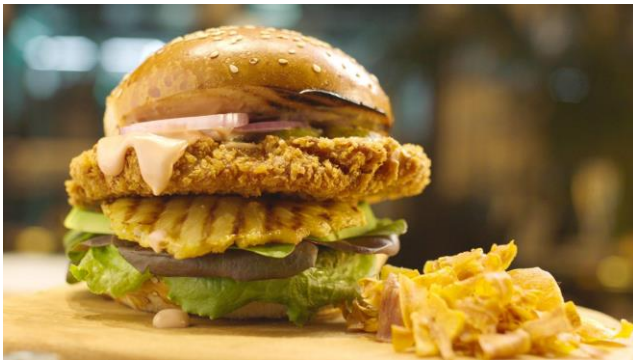
Crisp burger using SuperMeat's cultivated meat