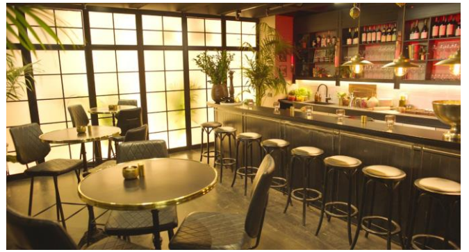
Dining venue adjoining to the pilot plant