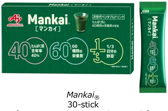
(an approximately 30-day supply)