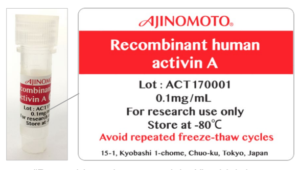
"Recombinant human activin A", which has obtained written confirmation of raw material eligibility from the PMDA

Ajinomoto Co. was a global pioneer in the development of a method for producing activin A, a growth factor that promotes cell differentiation, and has been supplying it to prominent basic research institutions. Amid demand for the provision of growth factors that are free of animal- and human-derived components for clinical research applications associated with advances in regenerative medicine in recent years, Ajinomoto Co. manufactured "Recombinant human activin A" growth factor using its original biotechnologies for producing recombinant proteins<sup>3</sup> with a higher level of safety and launched it for testing and research applications in March 2018. Thereafter, Ajinomoto Co. applied to the PMDA for a consultation on raw material eligibility for regenerative medicine and other products and in